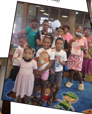
Dr. Robert T. Hollingsworth Public Library (Shelby)