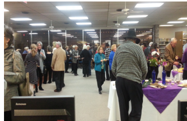
Grape Expectations Benefit Gala—to see more photos go to our Facebook page.

The proceeds from this year's Gala will go toward the improvement of the teen area at the Robinson-Carpenter Memorial Library. Providing library services to young adults in middle and high school is a fundamental service