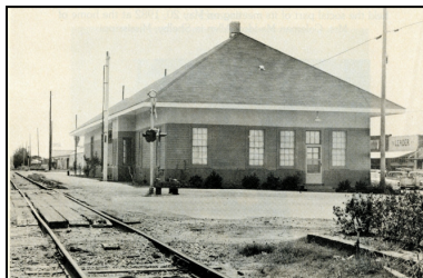
Photo of the railroad depot before it was renovated and converted to the library.