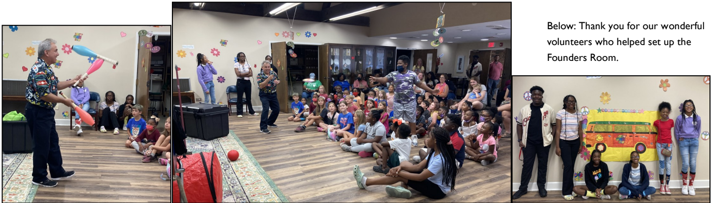
Below: Thank you for our wonderful volunteers who helped set up the Founders Room.