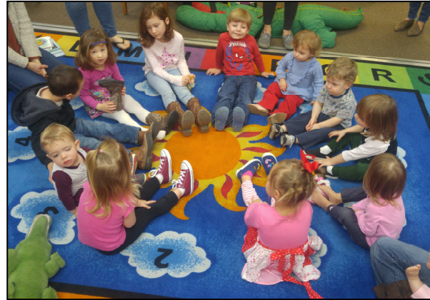
Preschool Storyhour on February 15th

With these resignations, the Administrative Board asked if I would come back to help get things on track before a new director is hired. It's pretty tough to say no to folks who you've known for many years. So I decided to work part-time until we can get everything running smoothly once again. One thing for certain is that there are