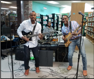
The Grandbois were enjoyed by all!