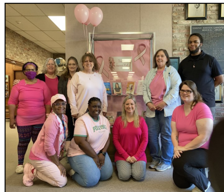
October 18th was Pink Out Cleveland! Day.