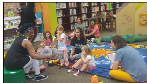
Preschool Storyhour is both fun and educational!

Parents are reminded that they must accompany and remain with their children during each Storyhour program.