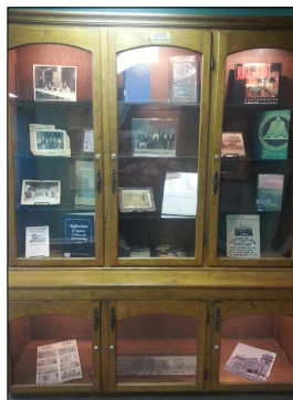
Be sure to check out the Mississippi Room display in the Kenneth McClafflin display cabinet.