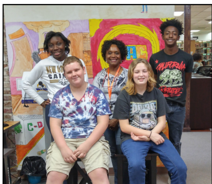
The Teen Advisory Group, better known as TAG, met for the first

meeting of the new school year on September 12th.